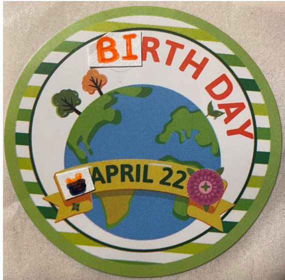
(fig. 1: Yoinked Swag)